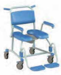
5100 5705 Tango XL Shower-toilet chair Capacity: 550 Lbs. Seat Width: 22"