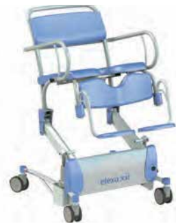
5100 5300 Elexo XXL Shower-toilet chair Capacity: 485 Lbs. Seat Width: 28"