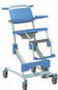
5100 5199 Flexo Shower-toilet chair Capacity: 330 Lbs. Seat Width: 18"