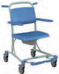
5100 5700 Tango Shower-toilet chair Capacity: 400 Lbs. Seat Width: 18"