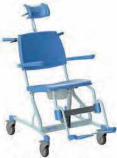
5100 5100 Nemo Tilt in Space Shower-Toilet Chair Capacity: 330 Lbs. Seat Width: 18"

*Tilts automatically with height adjustment.