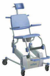
5100 5605 Reflex Shower-toilet chair with foldable footrests Capacity: 300 Lbs. Seat Width: 18"