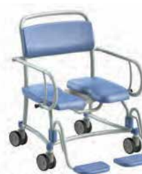
5100 5800 Tango XXL Shower-toilet chair Capacity: 800 Lbs. Seat Width: 28"