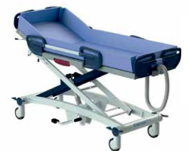
6100 2000/2010 Hydraulic 6100 2050/2060 Electric Marina Shower trolley Capacity: 500 lbs

* Technical life span is only guaranteed with correct use and maintenance in accordance with the supplier's instructions.