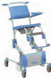
5100 5500 Elexo Shower-toilet chair Capacity: 400 Lbs. Seat Width: 18"