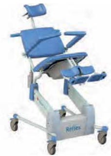
5100 5600 Reflex Shower-toilet chair Capacity: 300 Lbs. Seat Width: 18"