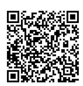
Scan to visit our website and learn more.