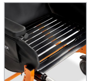
Comfort Tension Seating® increases support and sitting tolerance.