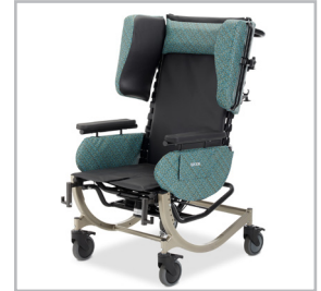
New frame design, including adjustable wings.