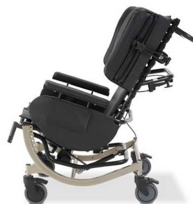
Shown with full padding and adjustable wings

Additional accessories, such as foot supports, specialty padding packages, trays, and positioning belts are available.