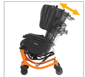
Pedal Rocker calms and creates contentment.