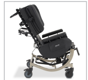
Enhanced mobility and tilt-in-space positioning gives users freedom.