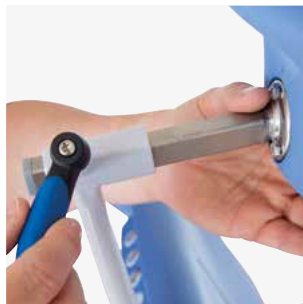
Height and depth-adjustable head / neck support.