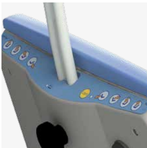
Easy-to-use touch controls on backrest (with pictograms).