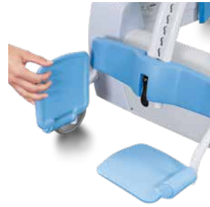
Detachable and foldable footrests.