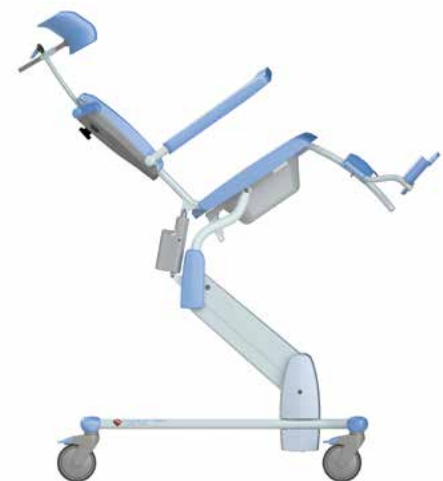
Reflex from lowest position to highest position with 30° tilt adjustment.