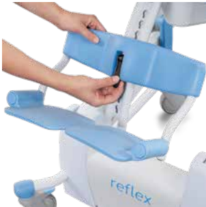
Detachable and height-adjustable footrests and calf protection.

Suitable for people with a moderate to very severe disability