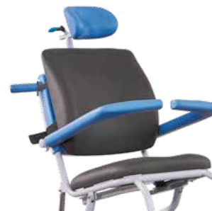
Option: 6950 5624 and 6950 5625 Platilon back and seat.