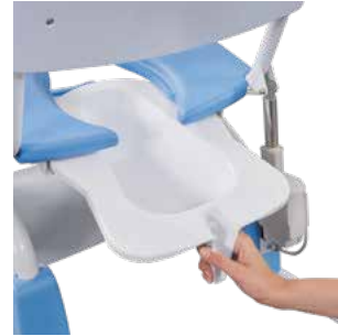
Option: Product no. 6950 1104 Plastic bedpan and lid.