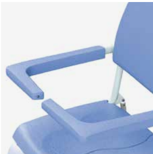
Independent, foldable upholstered armrests with front lock.