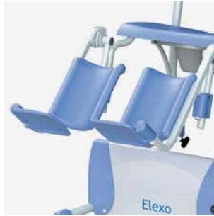
Option: Product no. 6960 8026 Adjustable comfort leg supports.