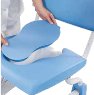
Ergonomically formed seat with inlay.

Suitable for people with a mild to severe disability