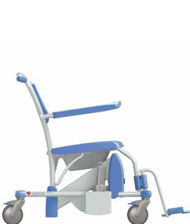
Seat height in lowest position 50 cm.