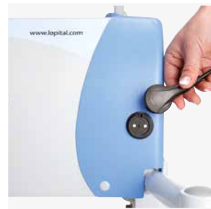
Charging point with magnetic coupling.