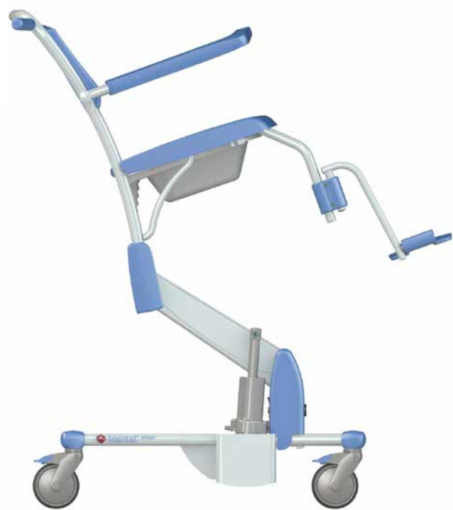
Tilt setting to 20 degrees.