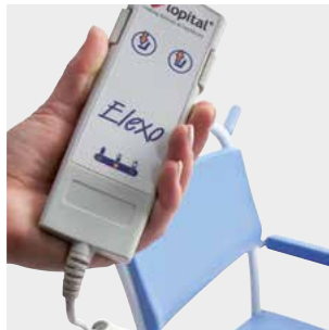
Hand control with battery indicator.