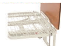
4" Bed Extender