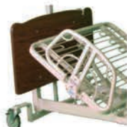
1/4 Length Side Rail