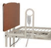
Pivoting Assist Bars